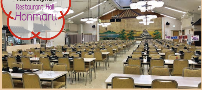
【Group Dining Venue - Large Hall】 2nd Floor, Capacity: 600 people