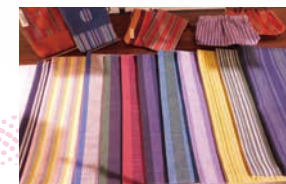
【folk crafts】 Aizu Momen (Aizu cotton) and textiles are among.