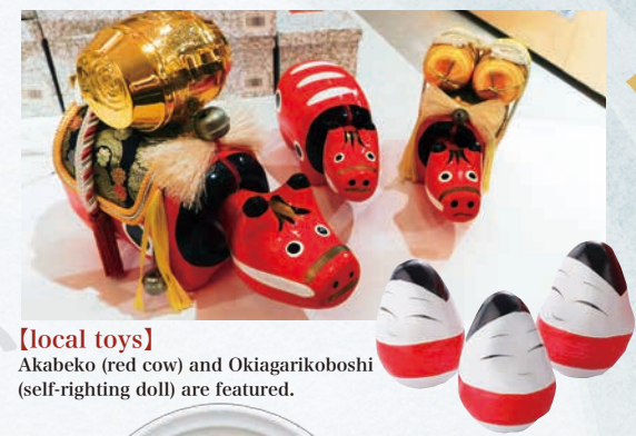
【local toys】 Akabeko (red cow) and Okiagari Koboshi (self-righting doll) are featured.