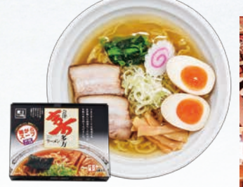
【kitakata ramen】 aizu hongo pottery aizu lacquerware